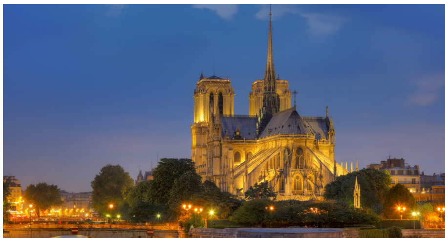
Notre Dame Cathedral - Paris