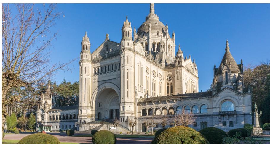
Basilica of St. Theresa - Lisieux